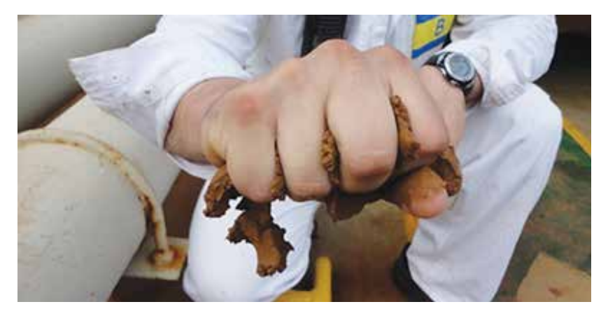
Market forces appear to be driving ships to carry cargoes that may liquefy.

A number of shippers and charterers are quick to point out that many cargoes have successfully reached their destination without incident and without owners having arranged their own precautionary sampling and analysis. There may be numerous reasons for this, such as the fact that cargoes are rarely homogenous in all holds, as well as the weather and sea conditions. Some voyage orders have been known to advise masters to avoid heavier seas/weather, which is rather impractical and ignores the fact that