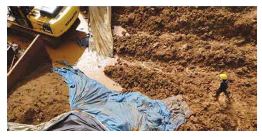
The on-board rectification of cargo moisture levels is far from straightforward.

It should also be borne in mind that bulk carriers are not the only ships that carry dangerous cargo. Container ships carry many dangerous goods and the Club can not be expected to pay for surveys to check that the numerous dangerous cargoes are safe for carriage. For similar reasons as those outlined above, P&I cover is unlikely to respond to the cost of discharging an unsafe cargo.