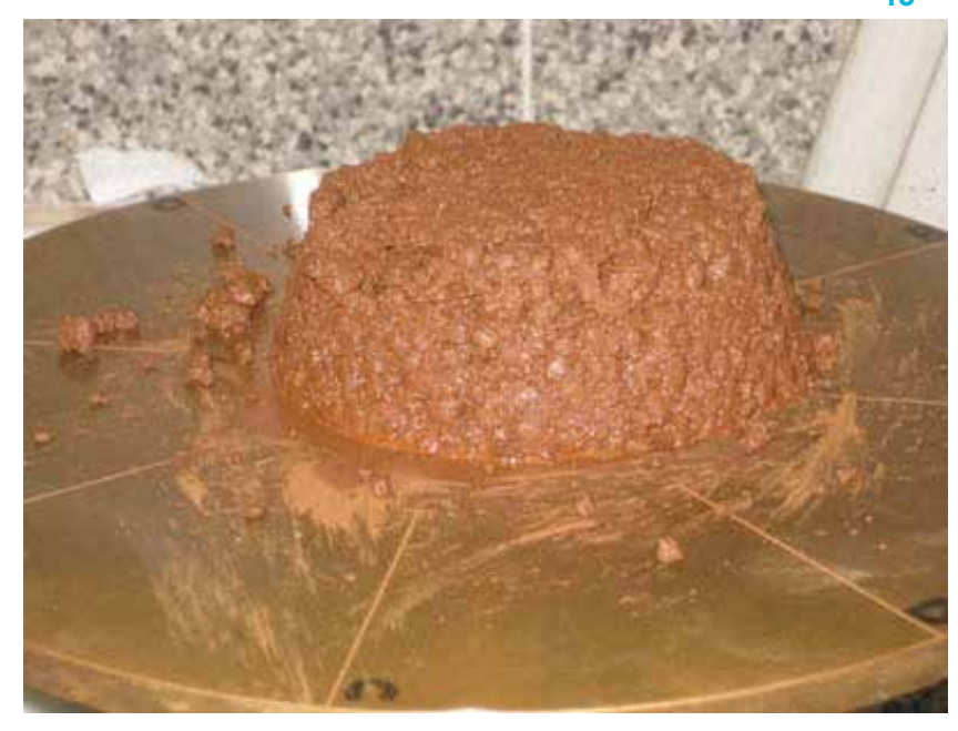
Flow table test.

1) Identification of hazard Prior to start of loading, the shipper must declare to the Master in writing