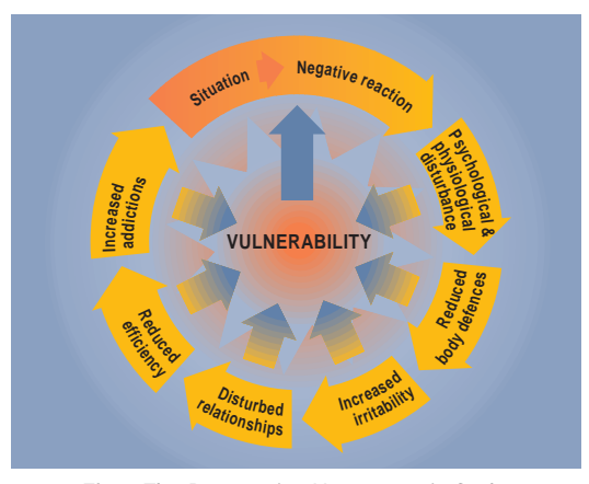
Fig 1: The Destructive Hermeneutic Cycle

Seafarers' holistic well-being is not to be found in simply ensuring that medical provisions and procedures on board match up to international statutory requirements. It is in the value added empowering of seafarers with an education in healthy life style choices that makes the significant difference. So it is that the holistic view needs to be taken. There needs to be a recognition that in the range of health care provisions, body, mind and spirit need to be nourished and to be healthy. The psychological stress and strain can be more all-encompassing than a seemingly isolated physical symptom. Assimilating the social mores of a multinational crew can be very exhausting for seafarers. Avoiding offence to another's customs, culture and creed can be a daily minefield in the close confines of the ship's social and working life. Some seafarers readily take to the adventure of social dialogue with members of the crew from other nationalities but others find the 'mismatch' can sometimes be overpowering. Crewing agencies need to take this into account when billeting a ship.