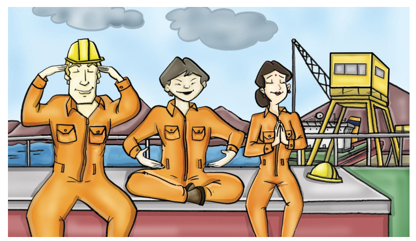
Mind, Body, Spirit

As most shipboard systems depend on some level of human involvement, the human link is a potential frailty that needs to be managed, monitored and nurtured. Healthy, happy, well trained and motivated mariners are essential to the safe running and commercial efficiency of any ship.