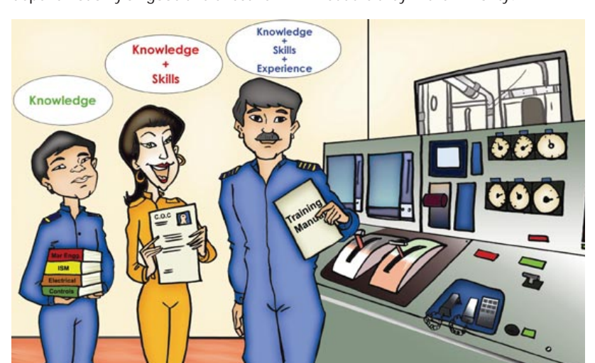
Making the difference

In fairness, there are owners, managers and manning agents who invest in the education and training of their mariners to beyond the minimum criteria set out within the STCW Code -but are they in the minority?