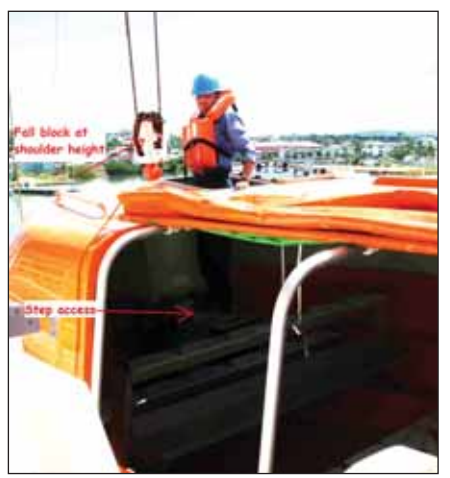
Forward hook access