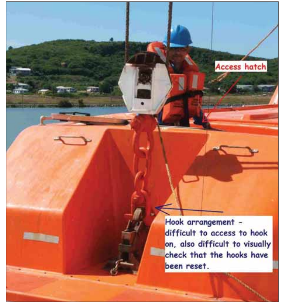
▲ These pictures show difficulties in hook access and visual checking

The MCA 555 study found that many existing on-load release hooks, while satisfying the current regulations, may be inherently unsafe and therefore not fit for purpose. Specifically, they have a tendency to open under the effect of the lifeboat's own weight and need to be held closed by the operating mechanism. As a result, there is no defence against defects or faults in the operating mechanism, or errors by the crew, or incorrect resetting of the hook after being released. Furthermore, the study concluded that the solution lay, not in training or