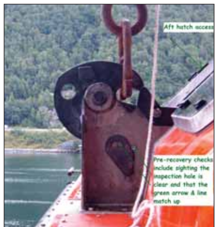
▲ aft hatch access