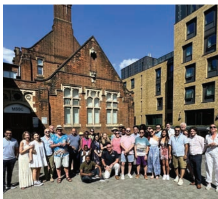
NI staff at the summer barbecue

The ISO 9001:2015 Quality Management Systems (QMS) certification surveillance audit was once again held on site with no non-conformities reported. The ISO auditor's report concluded that the system provides the required level of control, the organisation's context is well defined, leadership has been effectively demonstrated, and commitment levels are fully evident. The documented information to demonstrate that the system is well implemented and well understood throughout the organisation is acceptable. Our internal audit process and effective member and customer engagement continue to be key factors in the positive report from the ISO auditor.