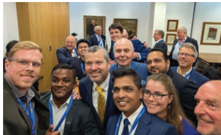
The IMO Secretary General meets NI members during the JGM