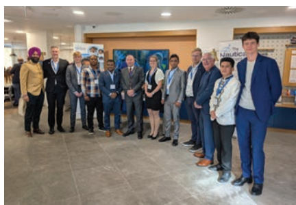
The Younger Members' Council

2024. Attendees from across the maritime industry shared insights and ideas to shape the Institute's future. A Younger Member Ambassador noted: "I was pleased to find an environment that not only welcomed younger voices but truly valued them. I left feeling motivated, grateful, and eager to encourage other young mariners to get involved."