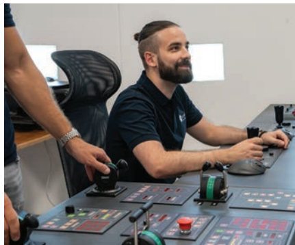
Six new DP training centres were accredited in 2024