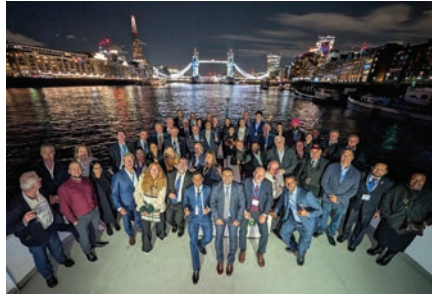
Cruise on the Thames during the Joint Governance Meeting (JGM)

Following the success of the inaugural Joint Governance Meeting (JGM) in late 2023, another was held in October