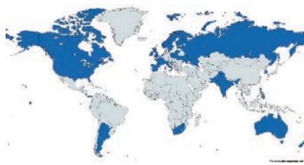
Certified Ice Navigators by nationality Jan 2021