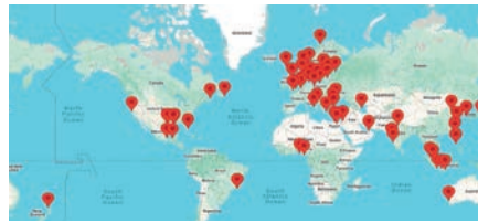
DP training centre locations

The UK scheme accredits eight companies, a figure which has not changed over the year. The Nautical