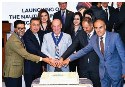
Celebrating the launch of the Egypt Branch