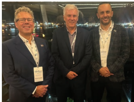
Launching the Türkiye Branch