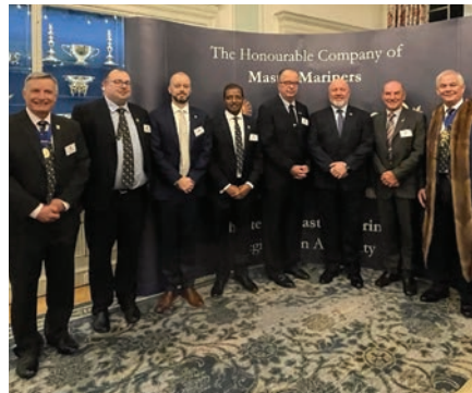
This years' CMMar awardees

E-book sales rose to 15% during 2024, and are expected to reach 20% in 2025 as a new platform agreement is secured.