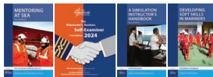
Publications released in 2025