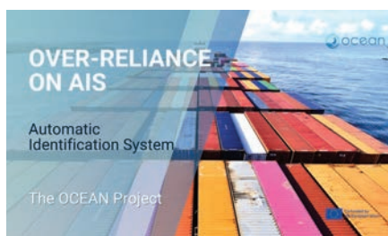
Some of the videos released by the OCEAN project this year