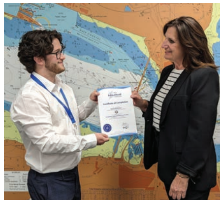
Presenting a certificate of course completion

Institute remains the only company authorised to carry out Training Accreditation in the United Kingdom on behalf of the MCA.